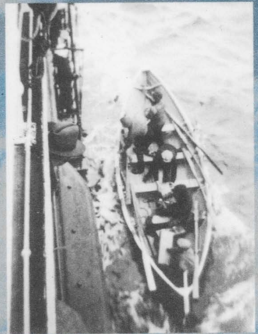
Loading goods and passengers from a yawl onto the "sooth boat" in mid ocean